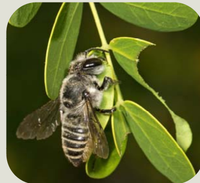
Female Megachile texana individual cutting a leaf that she will use in her nest.