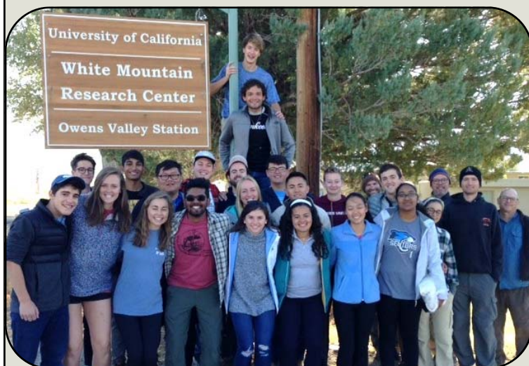
Geology students and faculty from University of North Carolina, Chapel Hill departing Owens Valley Station to Crooked Creek Station.