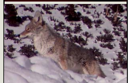
February: A coyote digs out a camera trap and turns it and a rubber twist-tie into chew toys.