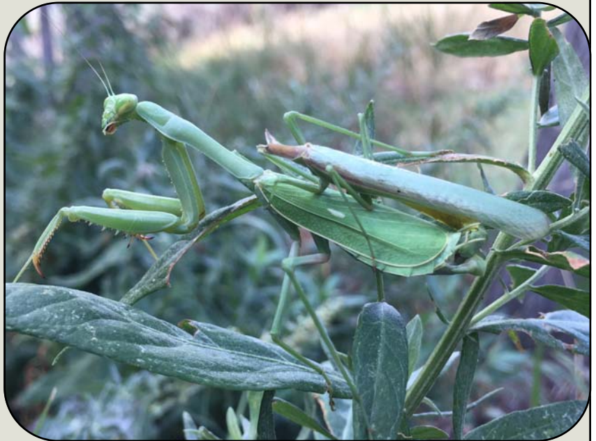
Headless male in copulation with a female.

My current research explores polyandry (multiple matings by females) and sperm competition in S. limbata . Male mantises have a problem—females might attack and consume them during courtship. The neurobiology of the mantis, however, allows for a decapitated male to inseminate the female. So, a male may inadvertently convert his body into offspring via cannibalism. But, a male must fertilize the eggs created from his body to reap this reproductive benefit. Herein lies a second problem—females may mate with multiple males in nature. The reproductive fates of cannibalized males is my current focus. At present, I am analyzing relative paternity through DNA fingerprinting of competing males in field encounters with females, along with staged mating experiments in captivity. I anticipate that these genetic results will shed light on sexual conflict in this intriguing biological system.