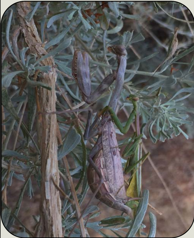
Male (right) in copulation with a female (left).

I have been conducting research on the behavioral ecology of praying mantises in the Owens Valley since 2006. The native mantis species Stagmomantis limbata exhibits sexual cannibalism -- the female's cannibalism of a courting male— in nature and captivity. This research investigates the interplay between resource availability and reproductive conflict between and within the sexes. My work has examined the effects of diet on female reproductive output, cannibalism towards the male, and male responses towards the female. While Stagmomantis limbata is my main study species, I have found at least four mantises in the Owens Valley: the native California mantis ( Stagmomantis californica ), the native ground mantis ( Litaneutria minor ), the introduced European mantis ( Mantis religiosa ), and the introduced Mediterranean mantis ( Iris oratoria ).