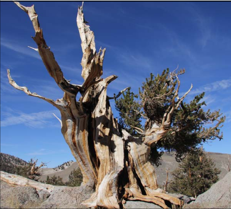
A bristlecone pine surviving despite most of the tree having died back in a perhaps drier or colder period.

Treeline is the ecological transition between two very different vegetation types: forest and alpine. Trees are limited in elevation by cold temperatures and because of this, we would expect treeline to move up in elevation in response to recent warming. In a recent paper in Global Change Biology , we found evidence for treeline advance of about 20 m in vertical distance throughout the Great Basin. In the White Mountains, treeline advance was even higher with advances as much as 150 m near Boundary Peak. However, this treeline advance does not look like we might expect it to given the species involved.