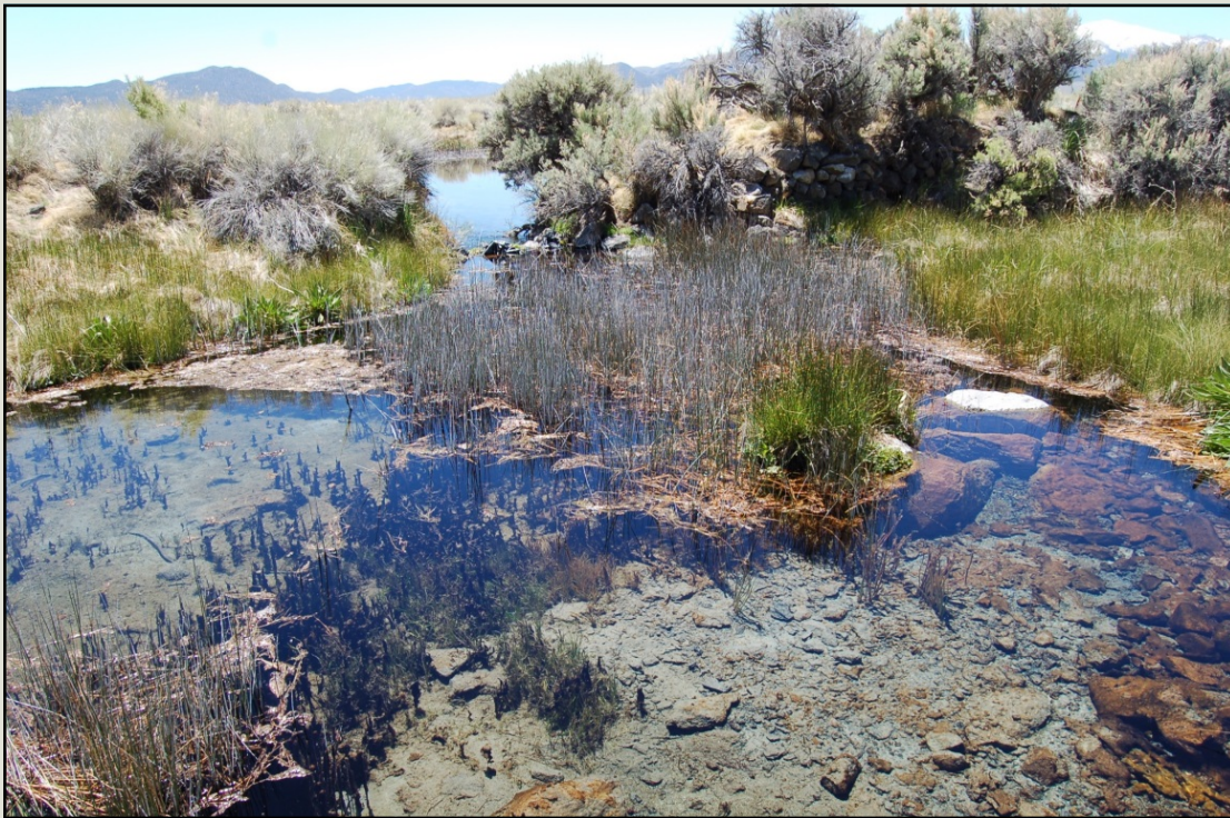
River Spring Ecological Reserve; a transmontane spring supporting a vast desert wetland system.

In such an under-explored area with unique ecosystems, terrain, and conservation concerns, there are many reasons to perform a