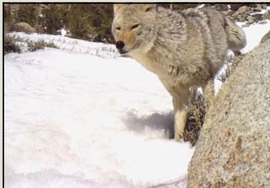
September 2016 to May 2017 sampling from one of the camera traps. L-R: badger, spotted skunk, bobcat, mountain cottontail, pika, and a coyote.