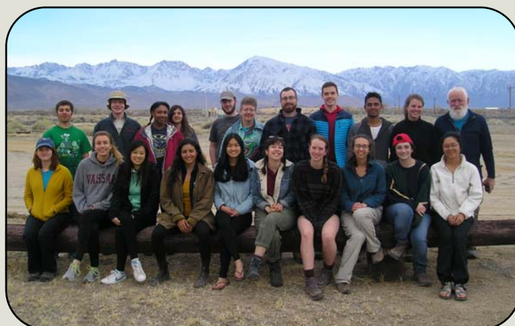
Vassar College faculty and students stay at WMRC while on an Earth Science field trip to Death Valley and the Owens Valley.