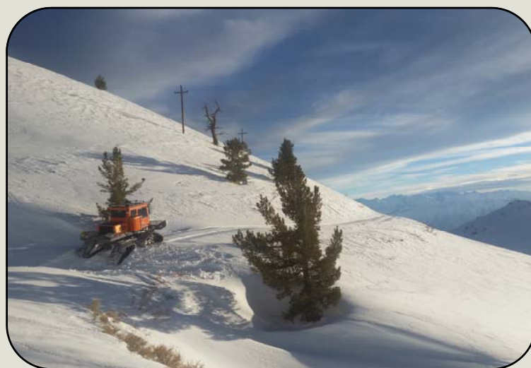
Heading home in the snow-cat after the first trip into Crooked Creek Station, February 15, 2017.