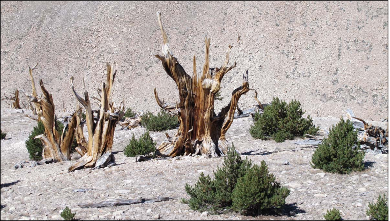
Above treeline at the Patriarch Grove in the White Mountains, young limber pine trees are establishing above adult bristlecone pine forests. Limber pine trees can be distinguished from bristlecone pines from their slightly more grey-green color and more shrub-like growth form when young; versus bristlecone pine's dark green color and more upright growth form.

face of whatever weather can throw at them. It is unlikely that limber pine will replace bristlecone pine, but these forests are going to look different in the near future with new stands above current treeline looking much more mixed between the two species than current treeline. In some cases, we may even see a change from a bristlecone pine-dominated treeline to a limber pine-dominated one.