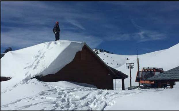
Crooked Creek-February 2017. Note the roof of the main lodge on right.

The Fall Newsletter is here. Gosh, it is hard to believe another year is just about finished for the White Mountain Research Center (WMRC) – but what a year it has been! Of particular note for those who are meteorologically inclined was the huge snow year we had. Folks across the valley at Mammoth saw 618 inches (15.7 meters) at the Main Lodge. This was the second biggest snow year on record there. This produced a ski season that lasted into early August. The White Mountains got their fair share of the bounty, but we still had a good summer season at the higher elevation stations. Crooked Creek opened on June 6th and closed on October 22nd and Barcroft opened on June 30th and closed on October 16th.