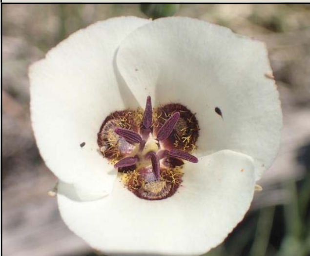
Calochortus excavates , a severely threatened eastern California endemic bulb, found in abundant numbers this year.

mented are rare and many have not previously been recorded in the area. My study area received high levels of precipitation this past winter which allowed for many annual plants to germinate that may not be present each year, adding to the overall count of taxa new to the area. This winter I am working on identifying my specimens, traveling to herbaria that hold specimens of the region and preparing for my next field season. Thank you to WMRC for helping me fulfill my research goals!