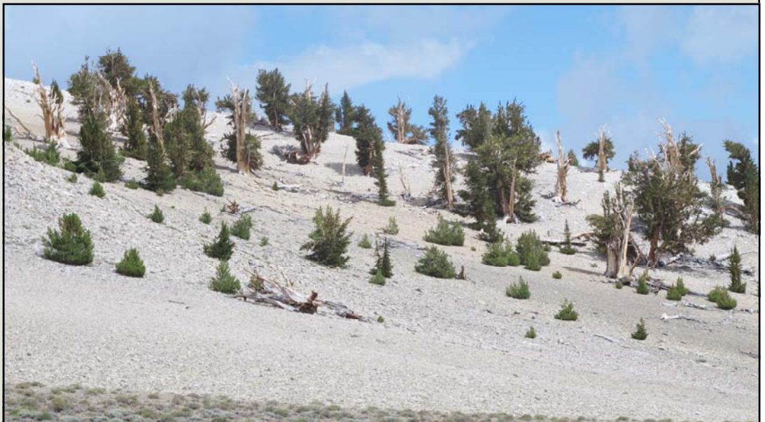
In some places in the White Mountains where bristlecone pine once stood before a cold snap killed them off, limber pine are now establishing in much greater numbers than bristlecone pine.

know and won't know for thousands of years, but we do know that climate change is having an effect on our forests in the White Mountains. Recent warming has opened up a real estate boom for young trees above current treeline and so far, limber pine has been far better than bristlecone pine at taking advantage of it. What will this actually mean for the future of bristlecone pine? We will have to wait a while to see the final results. Limber pine may have the advantage now, but in the long run, my money is on bristlecone pine. I'll have my descendants collect on that bet.