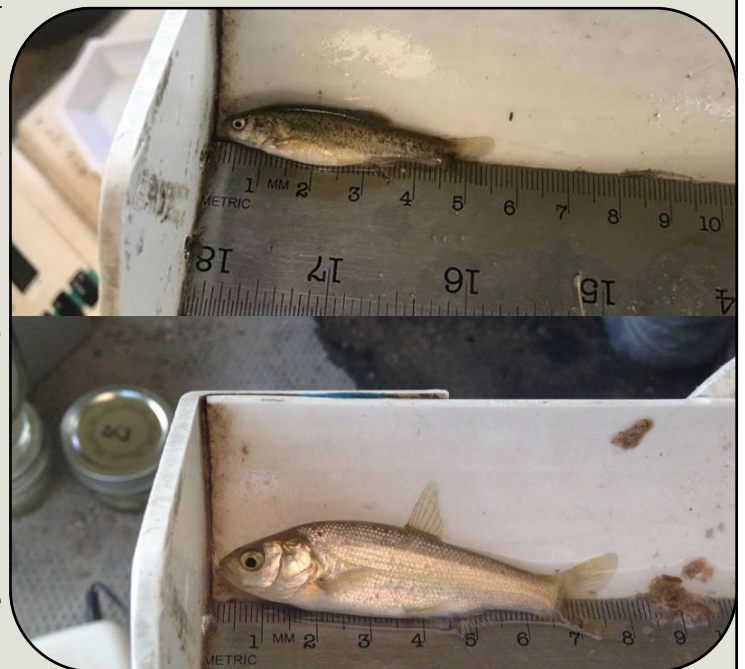
Owens speckled dace (top) and Owens hybrid tui chub (bottom) being measured to determine body condition.

I chose to study the tui chub and speckled dace because they present an important conservation challenge in the Owens Valley. Both fish are endemic to the Owens Valley, which means that this is the only place in the world where they are native. As locally evolved fishes, the tui chub and speckled dace are extremely tolerant to high and low temperatures, high salinity, and low dissolved oxygen levels. Despite these species' adaptations to the physiological stresses of the Owens River watershed, the introduction of predatory sport fish in combination with the hybridization of tui chub have caused extreme declines in the overall populations of tui chub and speckled dace. Managers are left with the challenge of keeping these native fishes alive while most of their historic habitats are unsuitable.