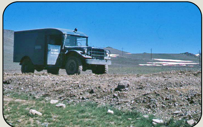
WMRS Navy ambulance.

If any readers of this newsletter have photos or reminiscences to share, please contact me at skypilots@ucla.edu . Photos of WMRS facilities and/or equipment from before 1980 would be of particular interest.